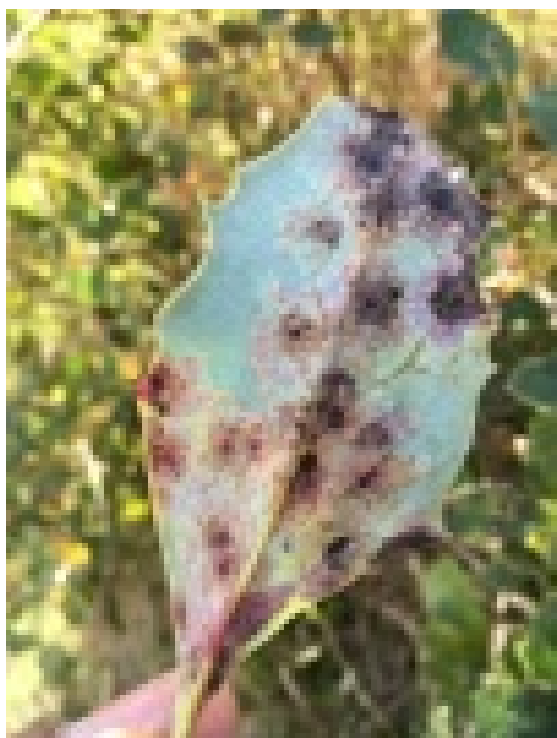
Aecial cups seen on barberry leaf near wheat fields in Nepal.

Nepalese and CIMMYT wheat scientists suspect new races of stripe and leaf rust infected the wheat crop in the Nepal Hills and Terai regions in the recent 2020 wheat season.