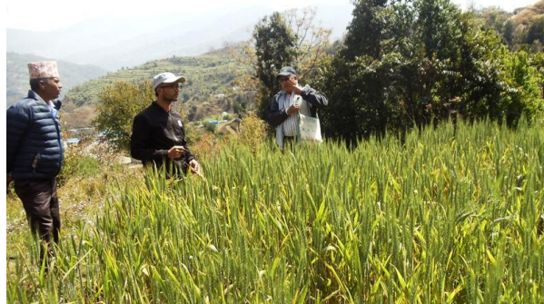
Observing stripe rust in wheat fields in Nepal.