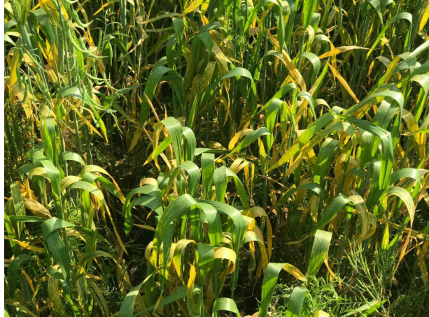
Stripe rust infected field.